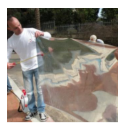
Step 4 - Spray film: Spray film on both sides to avoid static (less dirt in installation) and flatten the film.