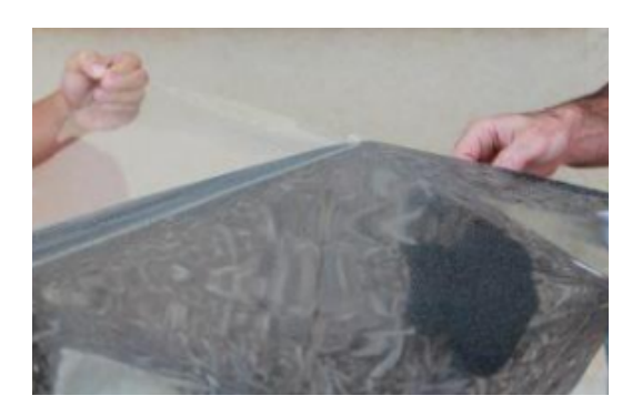
Step 6b - Attention! Two installers are recommended to assure careful handling of film during installation.