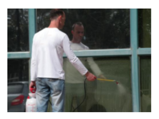
Step 5 - Window: Re-wet the window with a generous amount of wetting solution.