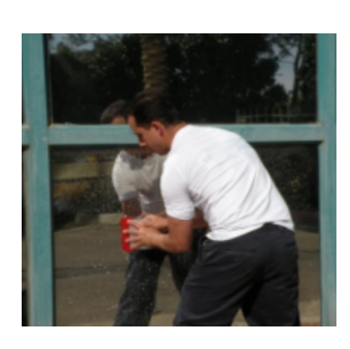
Step 12- Wet the film surface again, and pressing hard with the squeegee, wipe out from the center until all the air bubbles and remaining water has been removed from the edges.