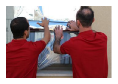
Step 8 alternative - The two installers position the film on the window with the wet adhesive side on the glass. While one installer supports the rolled film, the other pulls the release liner downwards from beneath.