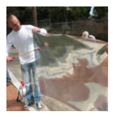
Step 7 - Remove release liner from film and spray the exposed adhesive layer with plenty of wetting solution.