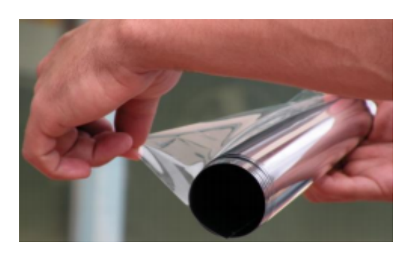
Step 3 - Precut film: Precut film to window size, leaving 2cm overlapping edge all around: prepare the film straight from the box, cutting from the hardcoat side with an sharp blade. Make sure the film is rolled with release liner outside (SR coating inside).