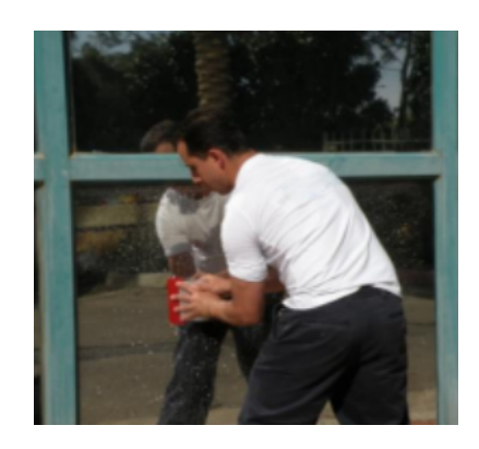
Step 8 - Position the film on the window with wet adhesive side on the glass.