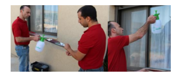
Step 7 alternative - Separate release liner from the precut film (rolled with liner outside) and spray the exposed adhesive layer generously with wetting solution. Make sure to wet the window with plenty of wetting solution!

In slight windy conditions, the "reverse roll" method may be helpful to ensure that no folding of film occurs during installation, replacing steps 7-8 above. More soap might be needed for better positioning of film on glass in this method.