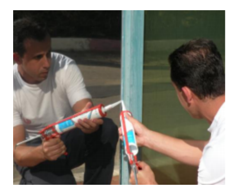
Step 14 - Edge Sealing: Allow film to dry for 24 hours, then within 72 hours, complete by edge sealing on all four edges.